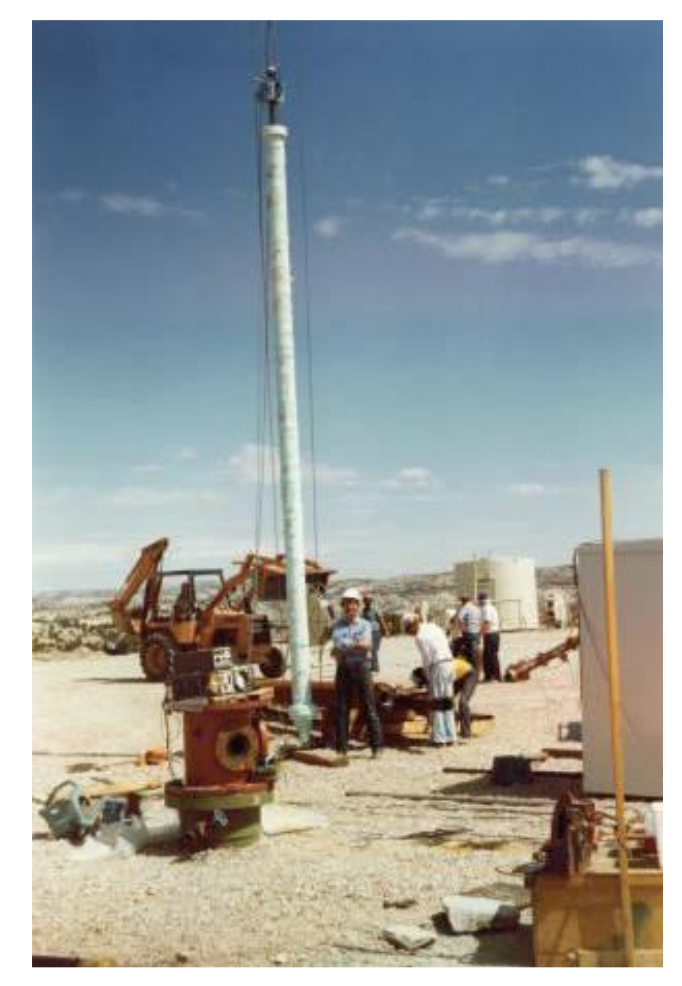
RF testing of the BART site in the 1980's, 10 miles away from TomCo Energy's Holliday Block Oil Shale Project in Uintah County, Utah