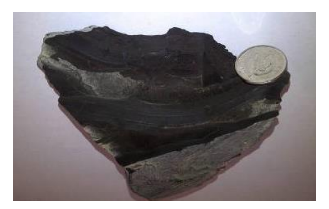
Kerogen (Oil) Shale